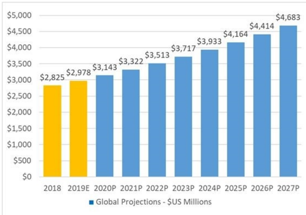
Global PERS Market Growth

Personal emergency response services (“PERS”) devices are used to call for help and medical care during an emergency. These devices are also used by a wide patient pool, as well as the general population, to ensure safety and security when living or traveling alone. The global medical alert systems market caters to different end-users across the healthcare industry, including individual users, hospitals and clinics, assisted living facilities and senior living facilities. The growing demand for home healthcare devices is mainly driven by an aging population, rising healthcare costs and a severe shortage of workers in the home healthcare market worldwide. It is very beneficial for seniors who have a history of falling or have been identified as having a high fall risk, older individuals who live alone and people who have mobility issues. We believe that the aging population will spur the usage of medical alert systems across the globe, as they offer safety and medical security while being affordable and accessible.